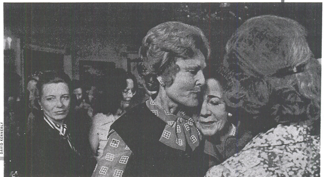
PAT NIXON GREETING MEMBERS OF THE COUNCIL OF WOMEN'S REPUBLICAN CLUBS

More typical of the Washington mood was the exchange about the President between a veteran newsman and an experienced capital lawyer. "He's Humpty Dumpty," said the reporter, remarking that the Nixon forces will not be able to muster a coherent defense. "No," the lawyer replied in a different metaphor. "He is a bull, maddened and racing ferociously around the arena, unable to shake the banderillas that pierce him everywhere. He still snorts and charges, but he is finished."