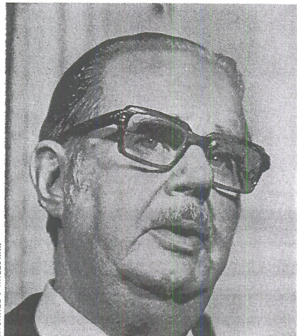
SENATOR HUGH SCOTT