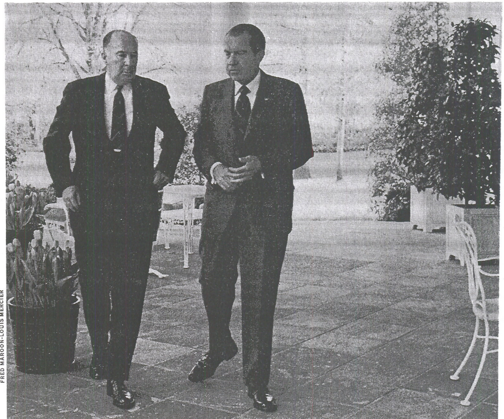
NIXON &amp; MITCHELL WITH ROSE GARDEN IN BACKGROUND IN 1971

P: Make a deal—that is the point. Baker [Senator Howard Baker], as I said, is going to keep at arm's length and you've got to be very firm with these guys or you may not end up with many things. Now as I said the only back-up position I can possibly see is one of a [inaudible] if Kleindienst [Richard Klein-