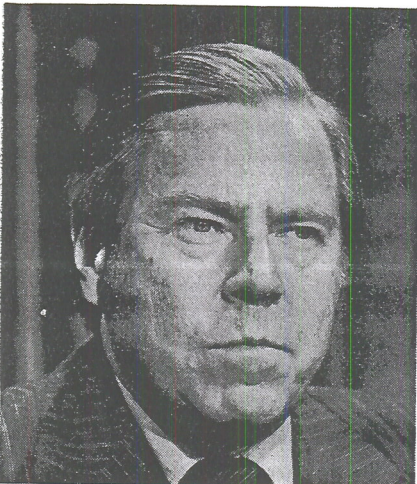
REPRESENTATIVE JOHN RHODES