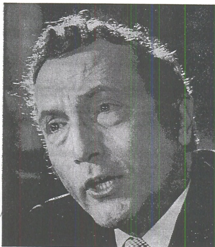
SENATOR RICHARD SCHWEIKER