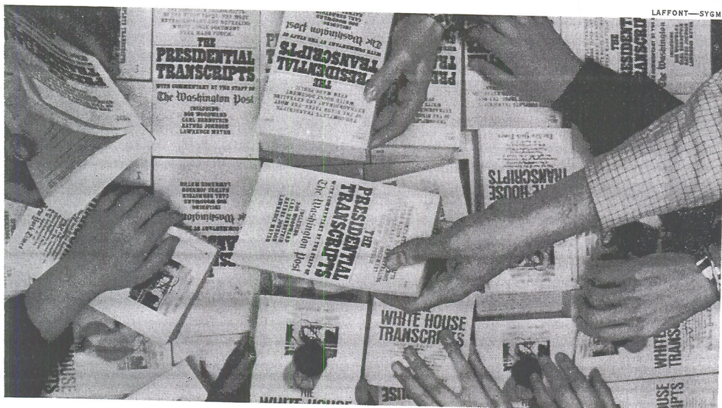
CUSTOMERS BUYING EDITIONS OF TRANSCRIPTS AT MANHATTAN BOOKSTORE Now it was the natural constituency that threatened.

A nationwide TIME-Yankelovich survey conducted by telephone last Wednesday and Thursday found that Nixon has lost an important weapon in his fight against impeachment: the previously prevailing fear felt by a majority of Americans that impeachment would mean disaster for the country. While 61% of the people polled shared that fear last November, only 38% expressed such concern last week. According to the survey, only 38% of the American people wanted Nixon to remain in office. A majority, 53%, wanted him either to resign or be impeached. A Louis Harris poll, also conducted last week, found that 49% wanted Nixon impeached and removed from office, while