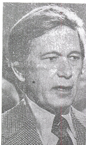
REP. DON EDWARDS ... "I can't understand"