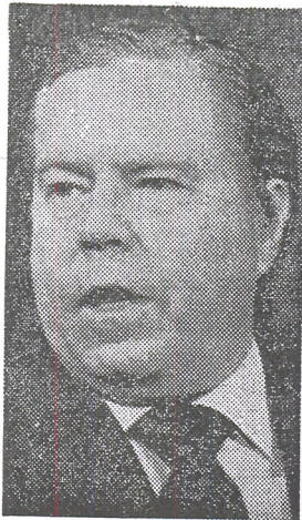
REP. JOHN J. RHODES ... "degrees of reality"