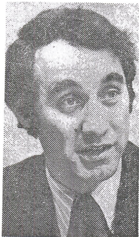
REP. EDWARD MEZVINSKY ... "hiding from truth"