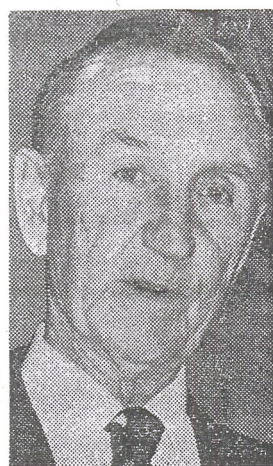
SEN. MIKE MANSFIELD ... "a further study"

established a precedent which will hurt our whole system of the administration of justice for a long time to come."