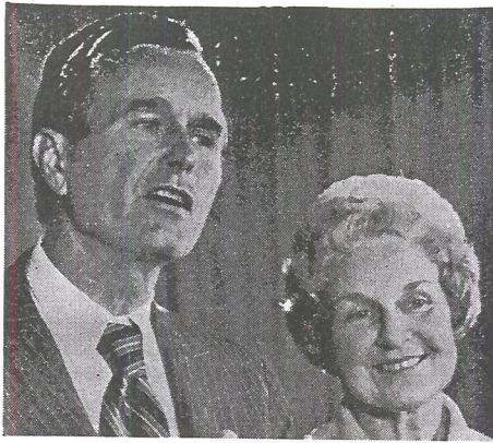
BUSH &amp; SMITH