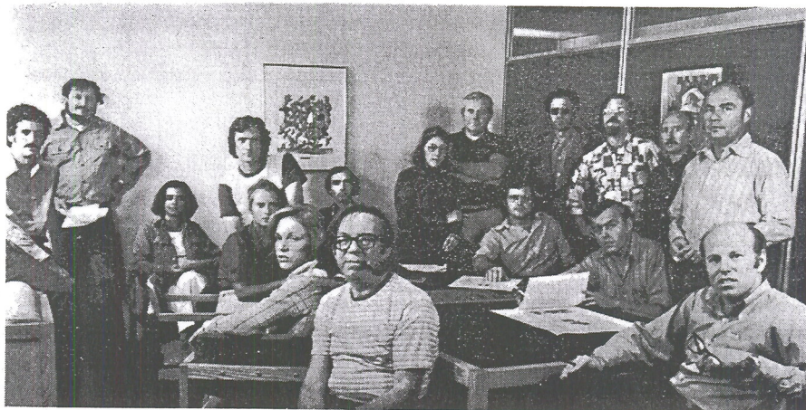
IMPROMPTU SUNDAY CREW IN NEW YORK