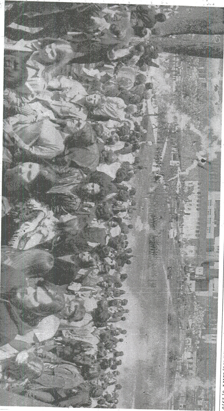
MOMENTS BEFORE TRAGEDY: Students at Kent State University campus retreating yesterday before tear-gas barrage from National Guardsmen

THE NEW YORK TIMES, TUESDAY, MAY 5, 1970