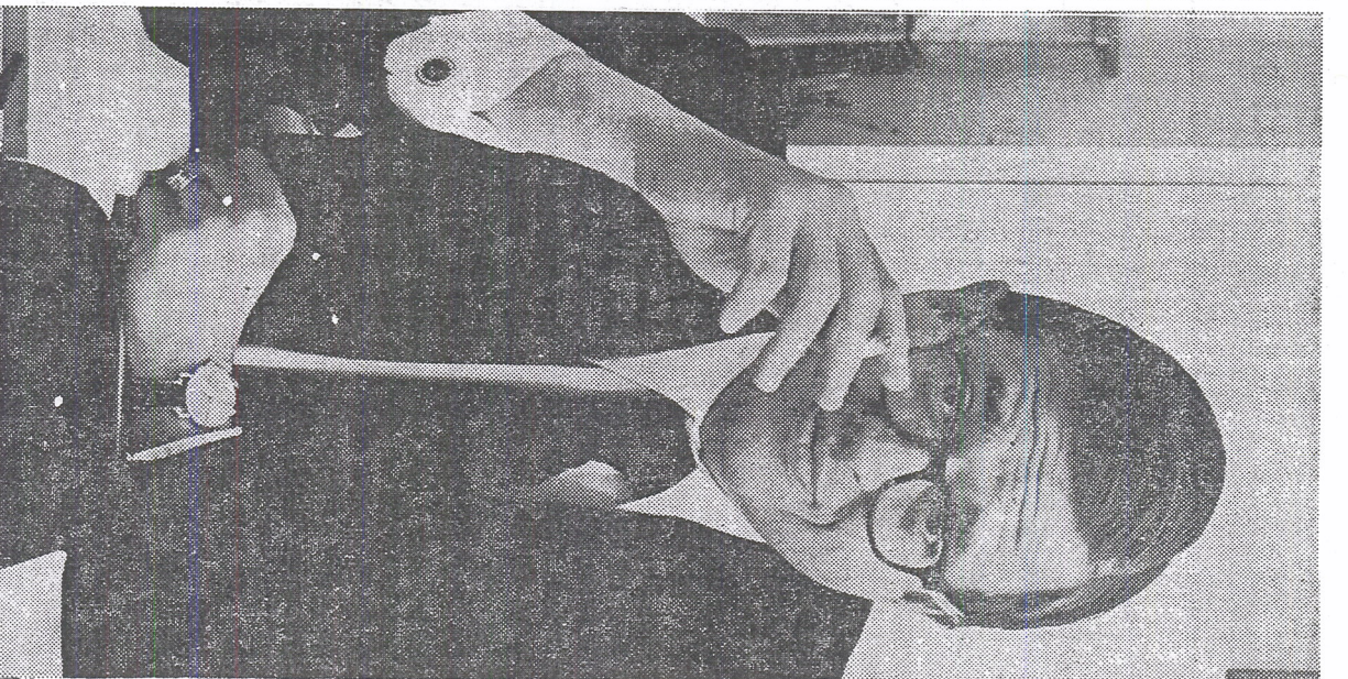
Charles Colson, former special counsel to the President, puts on his jacket to face photographers, after being indicted for conspiracy and obstruction of justice.