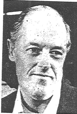
E. HOWARD HUNT