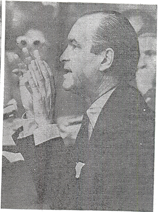
Richard M. Helms, former director of the CIA, tells Senate committee members of his dealings with White House.