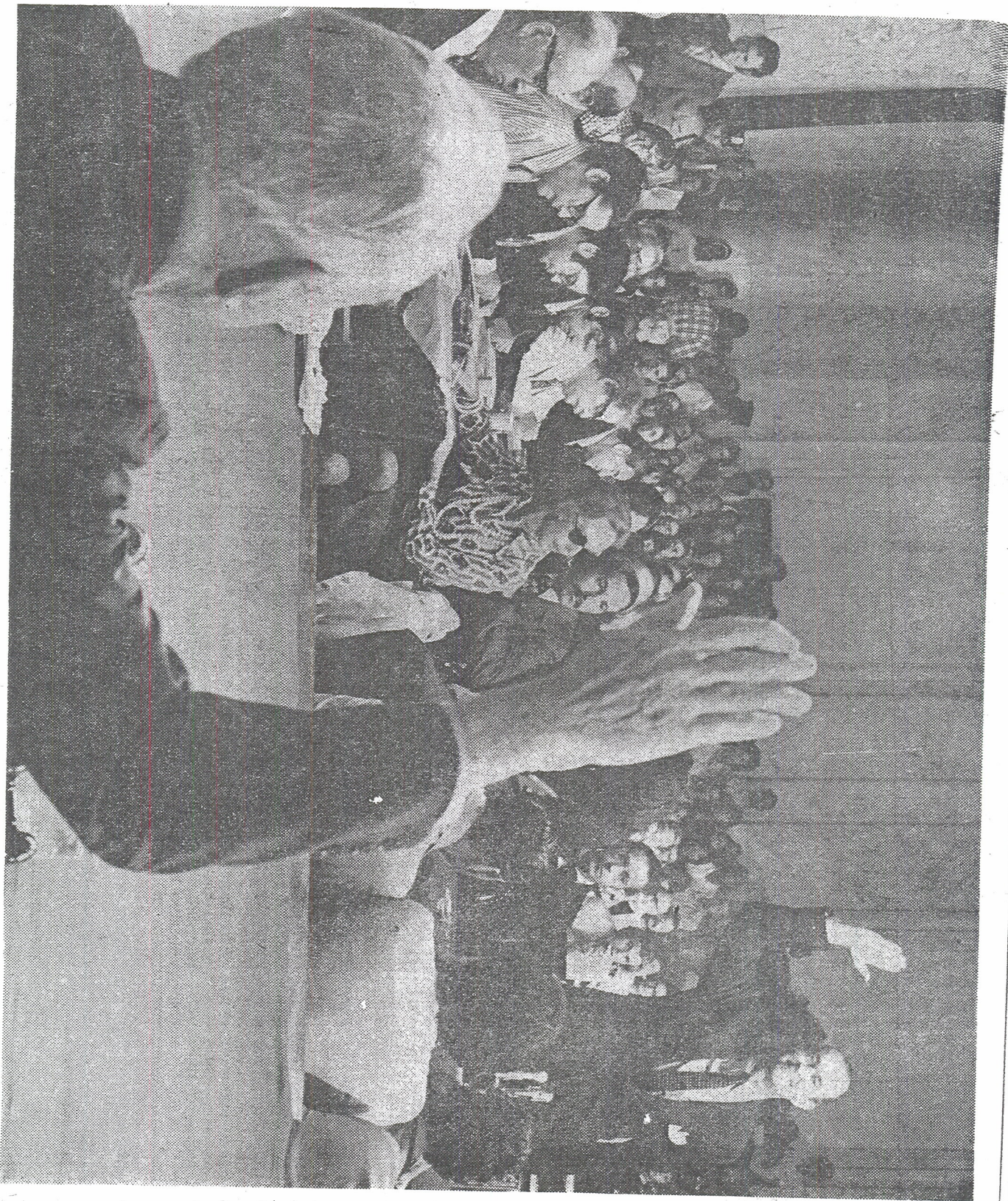
Yesterday's lead-off witness in the Watergate hearings, Richard Helms, right, is sworn in by Committee Chairman Sen. Sam Erwin.