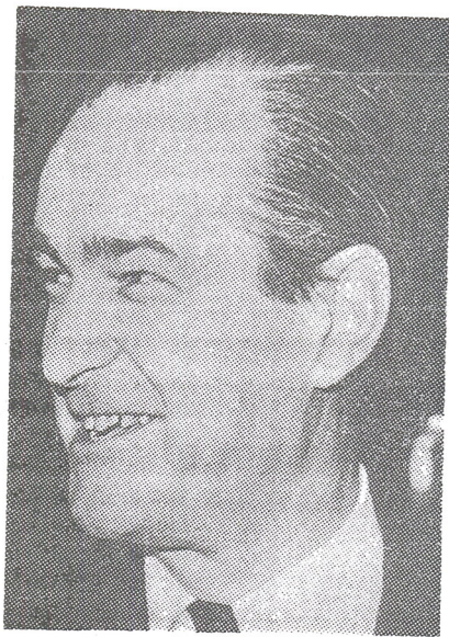
dent's principal intelligence advisor,

Some of Helms' expressed opinions are: "We are, after all, a part of this democracy and we believe in it. We would not want to see our work distort its values and its principles. We propose to adapt intelligence to American society, not vice versa . . . In a free society there is a limit to what a clandestine service can do. It cannot substitute for the government in a Bay of Pigs." He told a congressional committee: "In our society even a clandestine outfit can not stray far from the norms. If we get . . . the public, the press or the Congress against us, we can't hack it." Insofar as the printed record shows, during his tenure Helms was scrupulous in present-