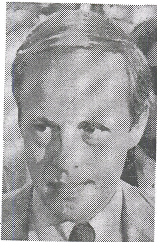
H. R. (Bob) Haldeman (left) and John W. Dean III differ over how much the former knew of cover-up.