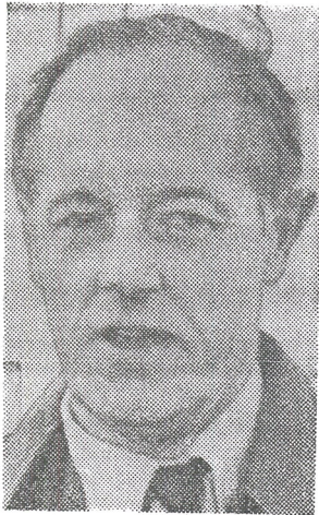
E. HOWARD HUNT ... faked documents

way related to the Watergate case. I was present but neither then, nor at any other time, did I give Mr. Gray any request, suggestion or instruction regarding what should be done with the contents. I do not know the nature of the contents.