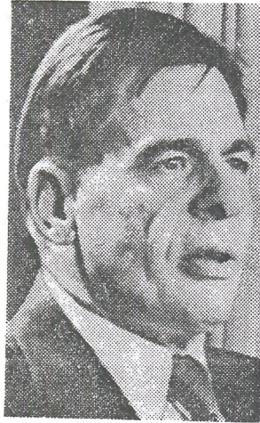
HENRY PETERSEN ... questioned Gray

"Mr. Gray received some of the contents of the Hunt safe at my office from Mr. Dean in June, 1972. Mr. Dean had previously sealed them in a large envelope. Mr. Gray was told by Mr. Dean that the contents were sensitive materials not in any