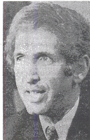
DANIEL ELLSBERG ... freed of break-in