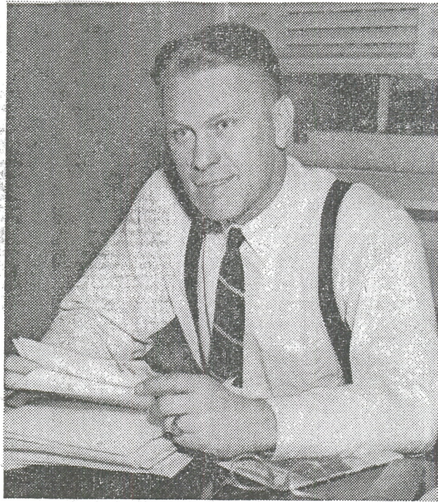
Points in Rep. Gerald R. Ford's career—reading mail in