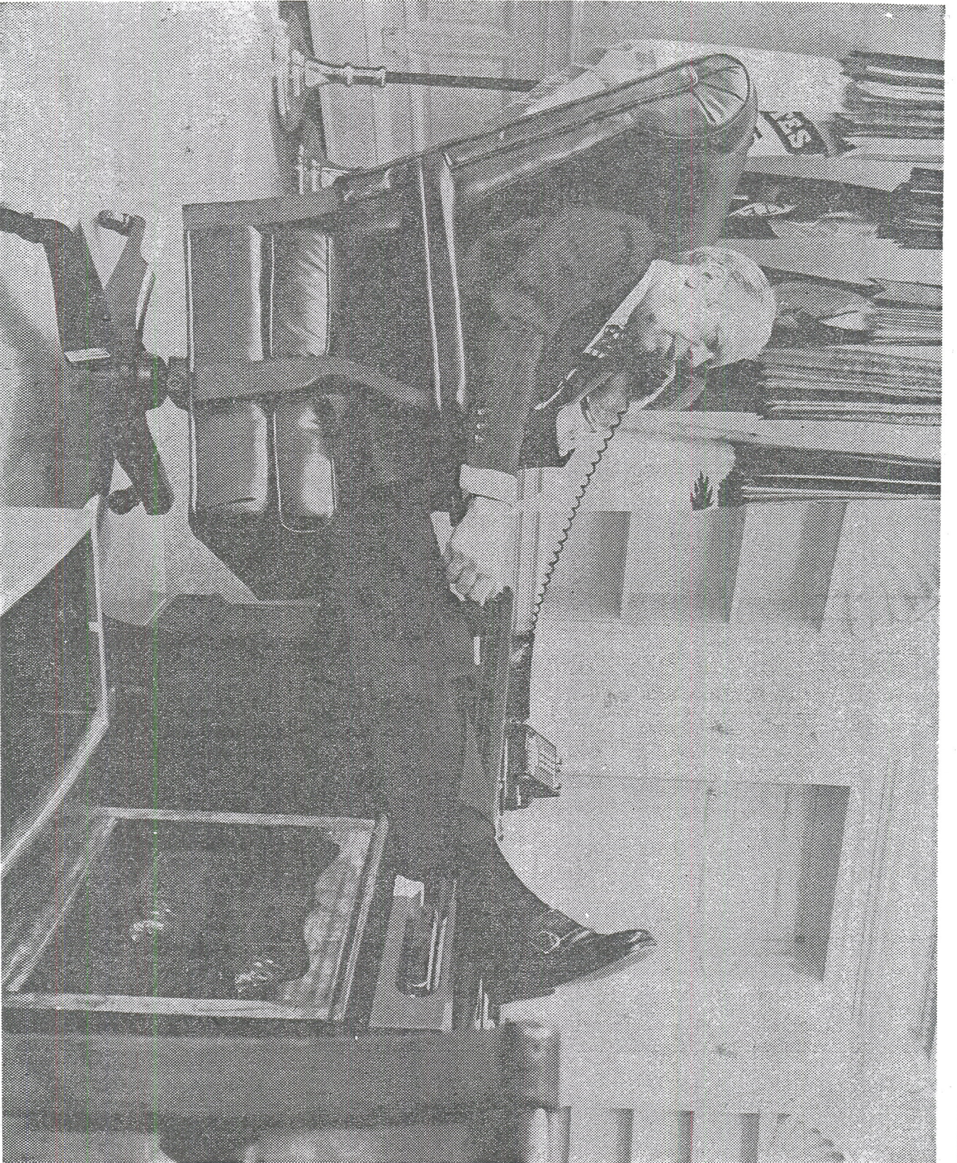
President Ford tends to business in the Oval Office during the first week of his presidency. Another picture, related stories on A8.