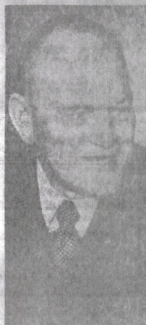
L. PATRICK GRAY 'A matter of decency'