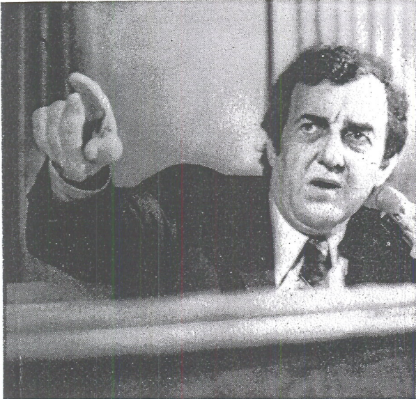
SENATOR MUSKIE AT HEARING Outrage and incredulity.

aides to testify publicly on the Watergate affair. Negotiations to try to break the impasse on this issue were under way between the committee and the White House, but there was no indication of how the matter might be compromised.