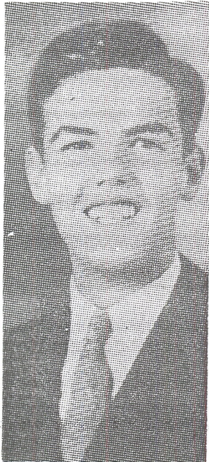
John D. Ehrlichman in the 1942 yearbook of Santa Monica High School.

A group of students, outraged at daily reports of lying and deception coming out of Washington, brought the matter before the cabinet of the Associated Student