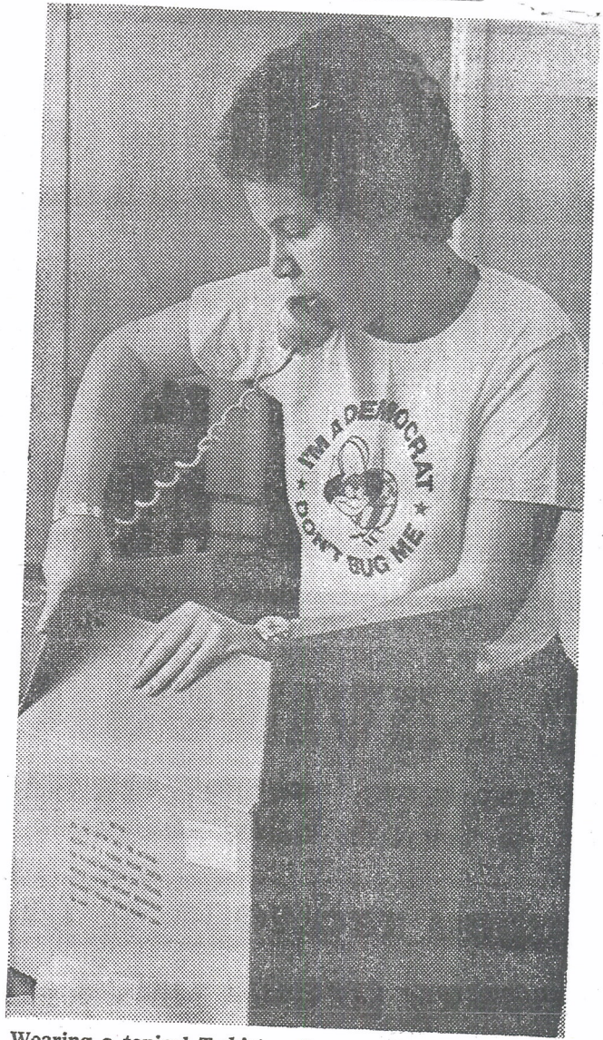
Wearing a topical T-shirt, a Democratic National Committee worker answers the phone during final packing.

"Because, I feel like this is history—right here in this room where I worked—and we'll never be here again."