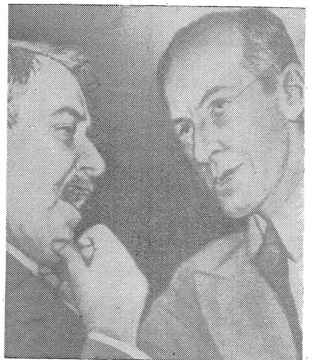
This photograph, circulated during the 1950 Senatorial race in Maryland, suggested that Millard Tydings, at right, associated with Earl Browder, a Communist leader. It proved to be a composite of a 1938 picture of Mr. Browder and a 1950 photo of Senator Tydings.