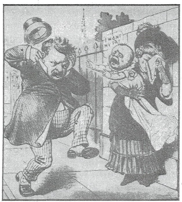
In 1884, Republicans made public that Grover Cleveland had fathered an illegitimate son when he was a bachelor.

For simplicity and effectiveness, one of the tricks of Mayor James M. Curley of Boston still stands out. He would find out the telephone number of his opponent's campaign headquarters and then run an advertisement in the classified section of the Boston newspapers. It read: "Late model Cadillac, must sacrifice, excellent condition, $1,000"—and then the phone number was listed.