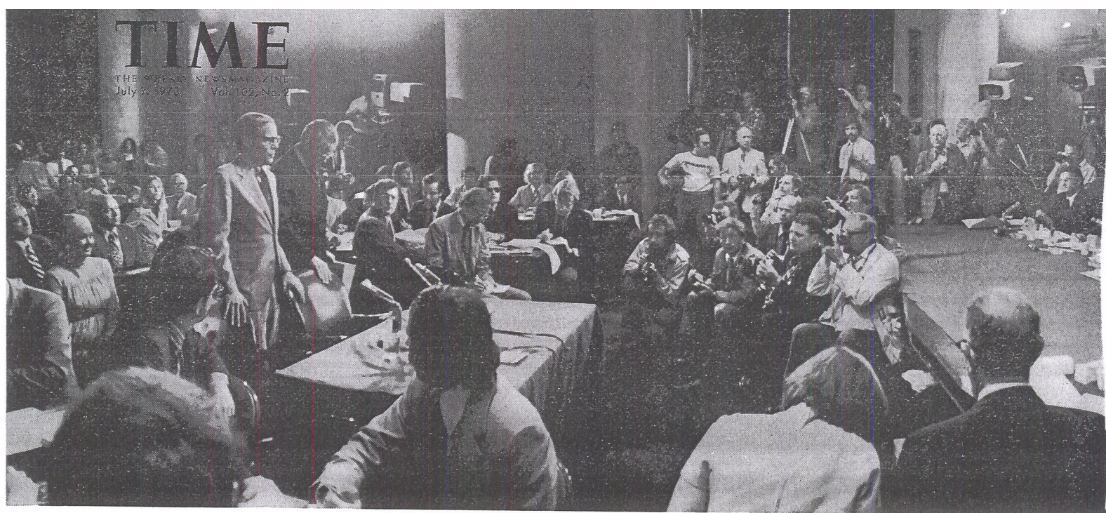
SENATE CAUCUS ROOM SCENE AS JOHN DEAN PREPARES TO BEGIN HIS WEEK-LONG WATERGATE TESTIMONY