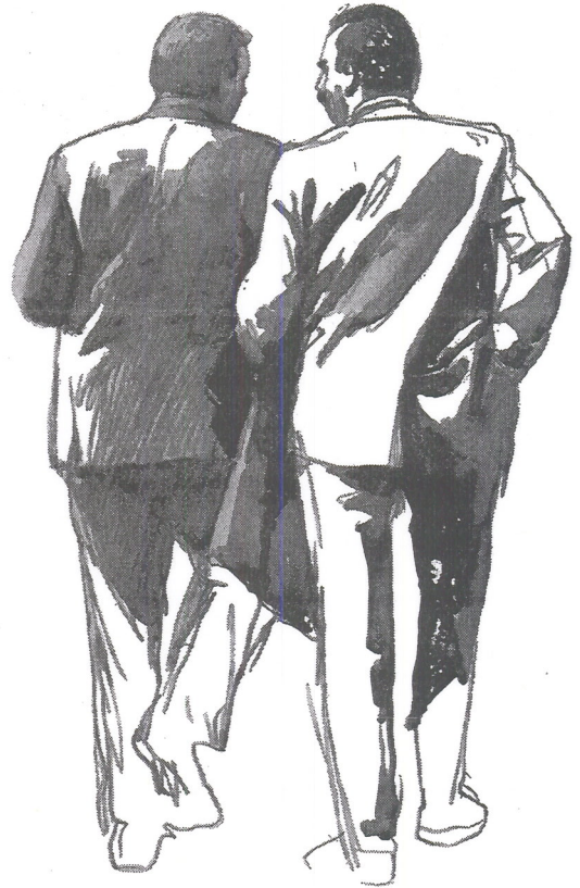
JUNE 19, 1972: "I next contacted Liddy and asked him to meet with me. I suggested we take a walk. It was shortly before noon, and we walked down 17th Street toward the Corcoran Gallery."

tween Dean and the President that go to the core of the momentous controversy. Confirming a Dean claim that it had at first sharply denied, the White House last week agreed that there had been at least 22 meetings and 14 telephone conversations between the two men. The sudden increase in the frequency of communication led Dean to wonder whether Nixon might be creating a basis for claiming Executive privilege and an attorney-client relationship in order to protect himself. Dean's version of the most significant of the meetings: