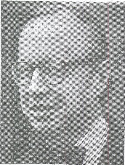
ARTHUR SCHLESINGER JR.