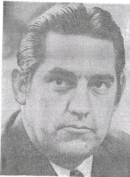
SEN. FRED R. HARRIS