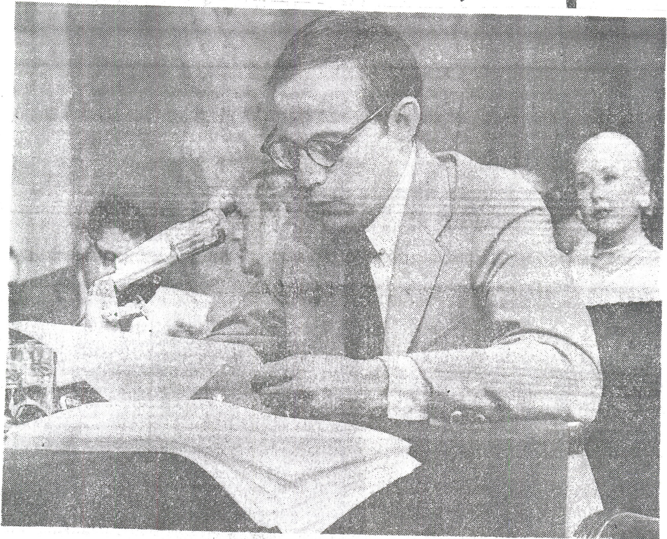
John Dean testifies at hearings held by the Senate select committee on the Watergate. His wife is behind him.