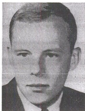
. . . AS COLLEGE SENIOR . . .