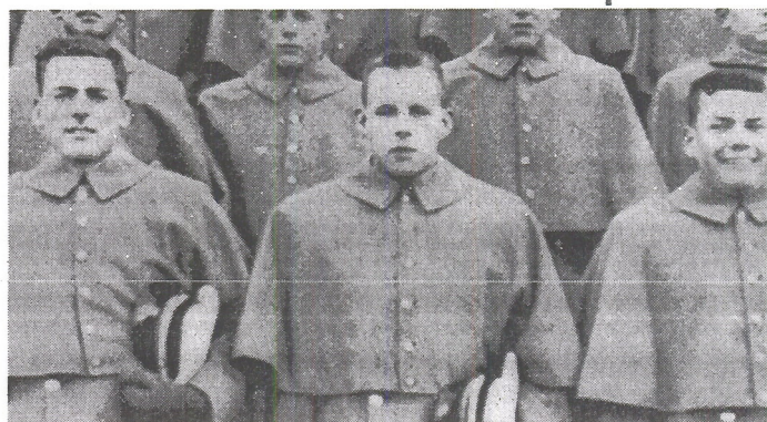
. . . AS MILITARY SCHOOL CADET

Staunton, young John studied self-hypnotism to improve his concentration and roomed with Barry Goldwater Jr., who now is his neighbor in Alexandria, Va. Dean graduated with a low B average and got by at Colgate with gentlemanly C's before transferring to Ohio's College of Wooster in 1959. There he founded a student pre-law club, played the part of a redneck witness in a campus production of Inherit the Wind and wrote a senior thesis on "The Social Responsibilities of the Political Novelists." He earned a master's degree in public administration from American University in 1962 and his law degree from Georgetown in 1965.