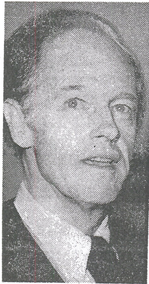
E. Howard Hunt Jr.

The sources said that Dean had related that the information about Mr. Nixon's alleged involvement came from Egil Krogh Jr., one of directors of the so-called "Plumbers Group" assigned by the President to investigate Ellsberg after the publication of the