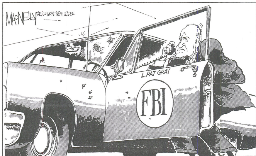
"White House, this is unit one...I'm pinned down at the Senate!... White House? Do you read me, White House?..."

Gray's automatic acceptance of the White House position on Watergate bothered the Senators. Had Dean's tie with Liddy worried Gray? "The President of the United States is not going to appoint his own counsel to conduct this kind of investigation, if the President has any reason to believe that his counsel has been involved," said Gray. Why hadn't Gray asked Nixon whether he really wanted the raw FBI files on Watergate? "I did not deem it appropriate." Amazed at Gray's assumption