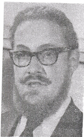
HENRY E. PETERSEN ... met to discuss continuing Watergate investigation. ROBERT H. BORK

A department spokesman said after Bork had delivered his statement yesterday that Petersen must now review all the Cox staff files to check the status of each investigation. "He also has to make a personal decision as to how long he wants to stay on the case himself," the spokesman added.