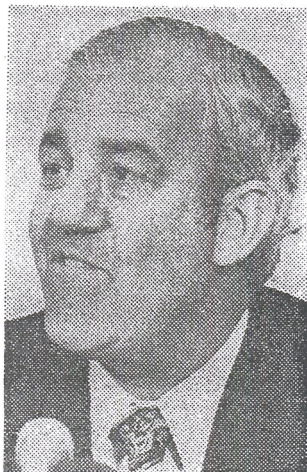
SEN. J. GLENN BEALL ... "partisan politics"

Another Maryland congressman, Democrat Paul Sarbanes of Baltimore, issued a statement calling the President's action an "arrogant abuse of executive power" and saying; "This country does not function under one man's rule." One of Sarbanes's aides said the congressman received many calls strongly against the President's actions.