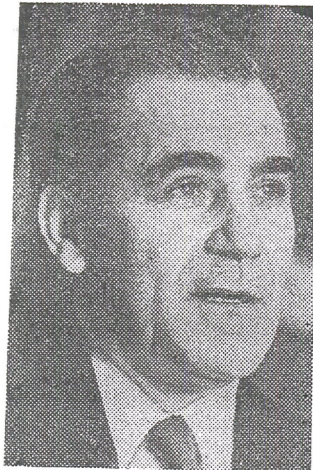
SEN. WILLIAM L. SCOTT ... defends Nixon

Sen. William L. Scott (R-Va.), one of the few who reported little reaction from his constituents to the fir-