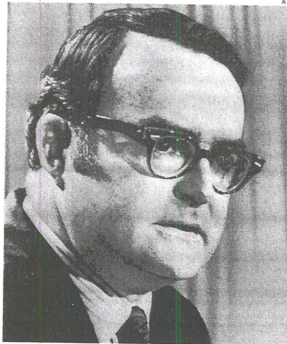
ACTING FBI DIRECTOR RUCKELSHAUS

The resignation of Acting FBI Director L. Patrick Gray III showed how far the deception had spread among men charged with law enforcement. Gray had failed to win approval from the Senate Judiciary Committee as permanent FBI director largely because of his chummy cooperation with the White House in the Watergate investigation. His eventual resignation thus was certain. But it came suddenly, after he had confided to "friends" that he planned to tell the federal Watergate grand jury in Washington about an astonishing cover-up of potential evidence on his part. This, he said, would implicate two of Nixon's closest aides. At the implied suggestion of John Ehrlichman, Nixon's