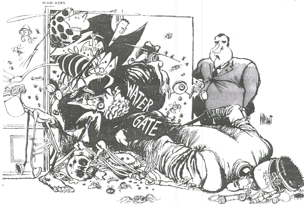
"We may have stumbled onto something."

Long before they were caught trying to bug Democratic headquarters in Washington, the Watergate conspirators were apparently getting plenty of practice at breaking and entering. During the trial of Daniel Ellsberg last week, a memo from the Justice Department was handed to U.S. District Judge William Matthew Byrne. It disclosed that two of the convicted Watergate conspirators—G. Gordon Liddy and E. Howard Hunt—had broken into the office of a psychiatrist to obtain files dealing with Ellsberg. A grim-faced Byrne ordered the document revealed to the defense. Then he told the prosecution that he wanted all the addition-