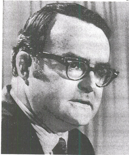
ACTING FBI DIRECTOR RUCKELSHAUS

The resignation of Acting FBI Director L. Patrick Gray III showed how far the deception had spread among men charged with law enforcement. Gray had failed to win approval from the Senate Judiciary Committee as permanent FBI director largely because of his chummy cooperation with the White House in the Watergate investigation. His eventual resignation thus was certain. But it came suddenly, after he had confided to "friends" that he planned to tell the federal Watergate grand jury in Washington about an astonishing cover-up of potential evidence on his part. This, he said, would implicate two of Nixon's closest aides. At the implied suggestion of John Ehrlichman, Nixon's