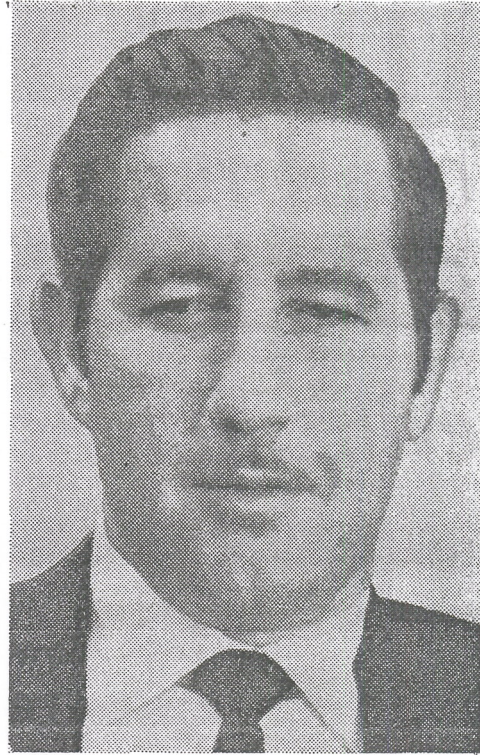
These are some of the men mentioned in accounts of election-campaign financing.