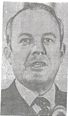
RICHARD G. KLEINDIENST ... "no kidding"

Interior Secretary Rogers C. B. Morton and Health Education and Welfare Secretary Caspar W. Weinberger said they hadn't been aware of the practice but declined further comment. Agriculture Secretary Earl Butz and William D. Ruckelshaus, former Environmental Protection Agency administrator and former acting director of the FBI, declined comment.