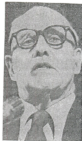
GEORGE MEANY ... "almost beyond belief"