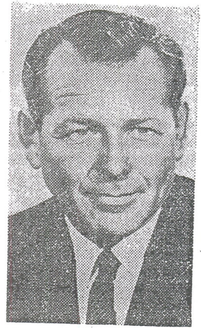
ROBERT H. FINCH ... "I'm astonished"

On the House side, Speaker Carl Albert (D-Okla.) said "that if this kind of thing did go on it was an