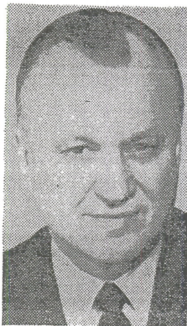
WALTER J. HICKEL ... "my message ... anyway"