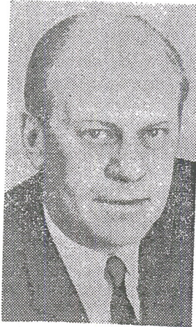
GERALD FORD ... "I see nothing wrong"

who seemed least surprised of all was Sen. Barry Goldwater (R-Ariz.), who said through a spokesman that he regarded recording conversations for historical purposes as appropriate but believes that people who are being recorded should be notified in advance.