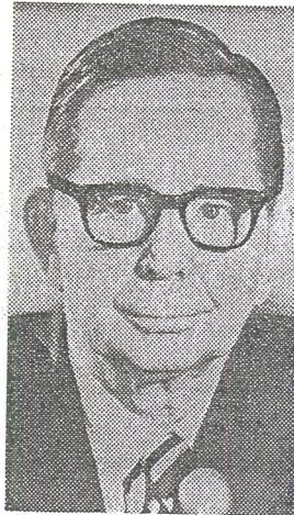
CARL ALBERT ... "it was an outrage"

Senate Republican leader Hugh Scott of Pennsylvania said he didn't know about the recordings "but always assumed, as far as phone calls are concerned, that there must be some method of keeping a record."