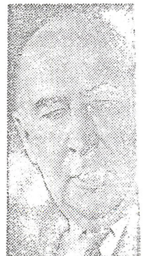
John Mitchell ... heads can

Mitchell said of McCord: "He has as we understand it a number of business clients and interests, and we have