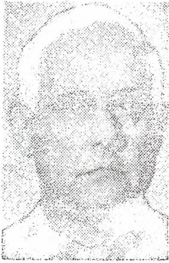
Bernard L. Barker