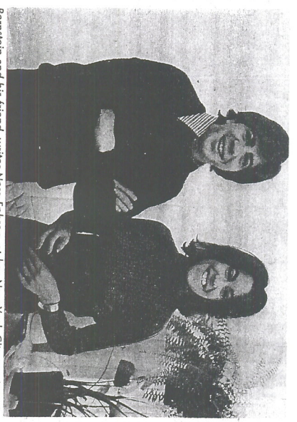
Bernstein and his friend, writer Nora Ephron, at her New York City apartment. Bernstein says he and Woodward will probably work together on more projects.

Observations, Box A, Mobil Oil Corporation, 150 East 42 Street, New York, N.Y. 10017