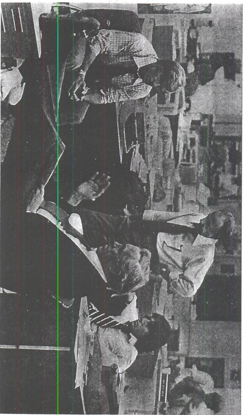
Robert Redford (l), Jack Warden (standing), Dustin Hoffman (r) and Jason Roberts confer on Watergate in a

scene from the movie version of the Woodward and Bernstein best seller that turned them into celebrities.