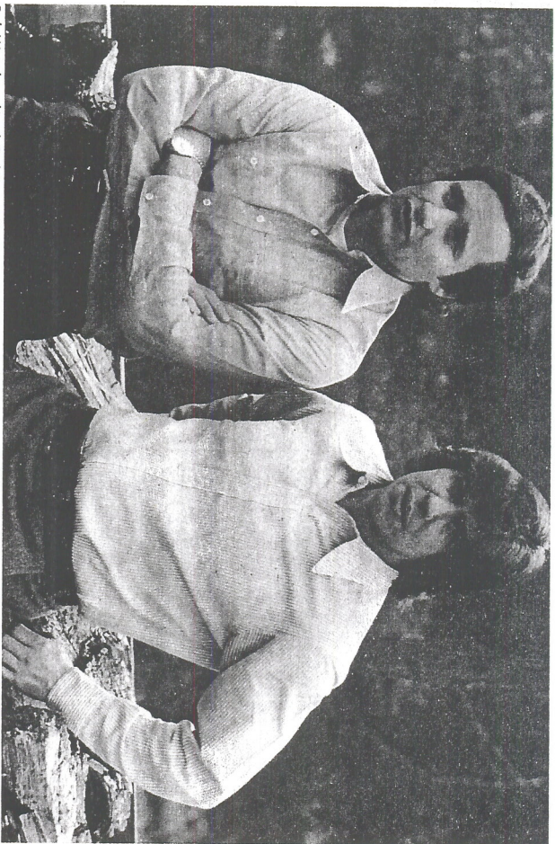
Bob Woodward and Carl Bernstein, instrumental in exposing the Watergate scandal, are publishing a book, "The Final Days."

On the end of Nixon's Presidency. A film based on their first book, "All the President's Men," is showing across the U.S.