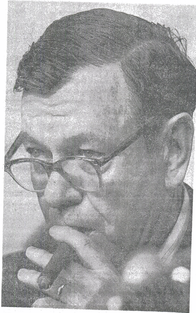
United Press International