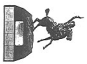
The 1933 "Bronco Buster" Trophy.