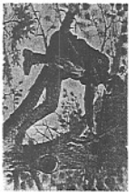
Union Army sharpshooter using a heavy match rifle.