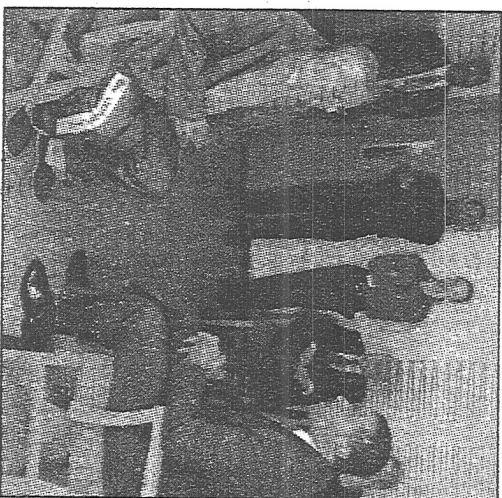
Dexter King (right), son of slain civil rights leader Martin Luther King Jr., meets with confessed killer James Earl Ray.