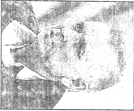
James Earl Ray

In order for Ray to get a trial, his attorneys must prove there is new evidence that could exonerate him.