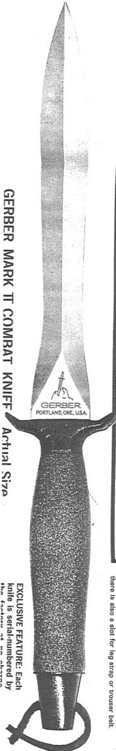
GERBER MARK II COMBAT KNIFE Actual Size

The handle is a solid aluminum casting which includes hilt (or guard) and pommel (or end) in one rugged piece. Its design is all functional, not modified by the limitations of other handle types, such as bone, wood, or turned styles. It won't rot or corrode. The grip has Gerber's permanent "Steel-Grip" dull finish—stainless steel sprayed on in molten droplets to give a non-slip surface like a cat's tongue. The hilt and pommel are coated with black, non-reflective, permanent Duracron. The blade has a notched tang and is anchored into the handle with thermosetting epoxy. It will never loosen.