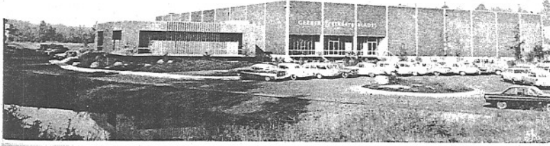
Gerber Legendary Blades, main office and manufacturing plant, Portland, Oregon

reputation for cutlery of unexcelled quality. Should your knife prove defective at any time, we will replace it or repair it free of charge upon receipt of the defective knife.