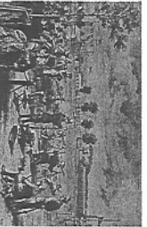
Creedmoor turned from a wood-covered farm to a colorful, flag-traped range.