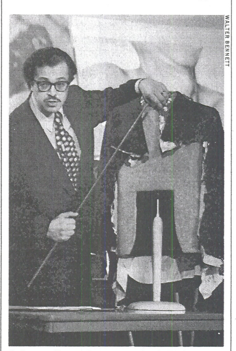
Suit coat Kennedy was wearing in Dallas