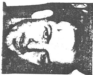
Was E. Howard Hunt (right) in Dallas that fateful day in 1963 to kill Lee Harvey Oswald (left) after the assassination?

According to sources close to the Select Committee on Assassination, the document reveals: