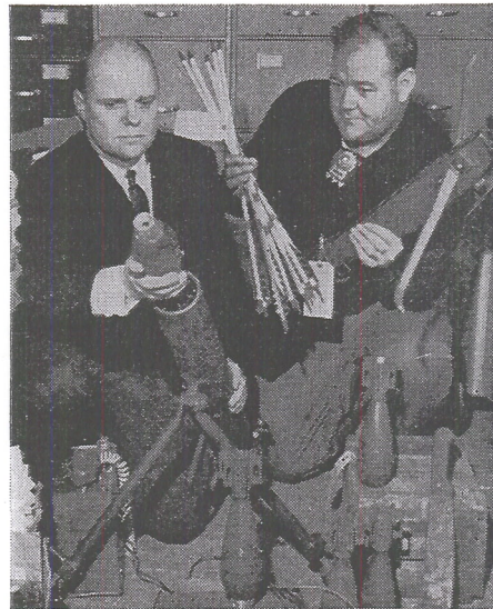
N.Y. Daily News