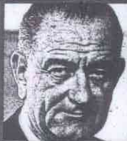
LBJ: Massive cover-up