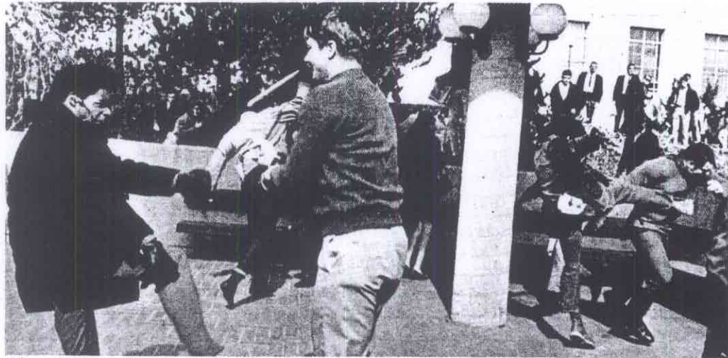
New Left militants attacking YAF members attempting to attend classes at the U. of California at Berkeley.