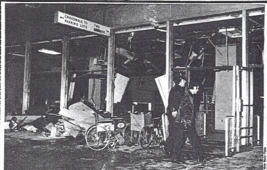
Blasts from the past: 26 died at LaGuardia. FBI diverted attention from multiple, exact similarities to explosion shortly afterwards of bomb claimed by Anti-Castro Cubans and planted—in locker at Miami International Airport.

The Secret Service also wasted valuable time questioning Pieman Aron Kay, despite the fact that he is a known refugee from a 3 Stooges movie, incapable of throwing anything but an occasional pic.