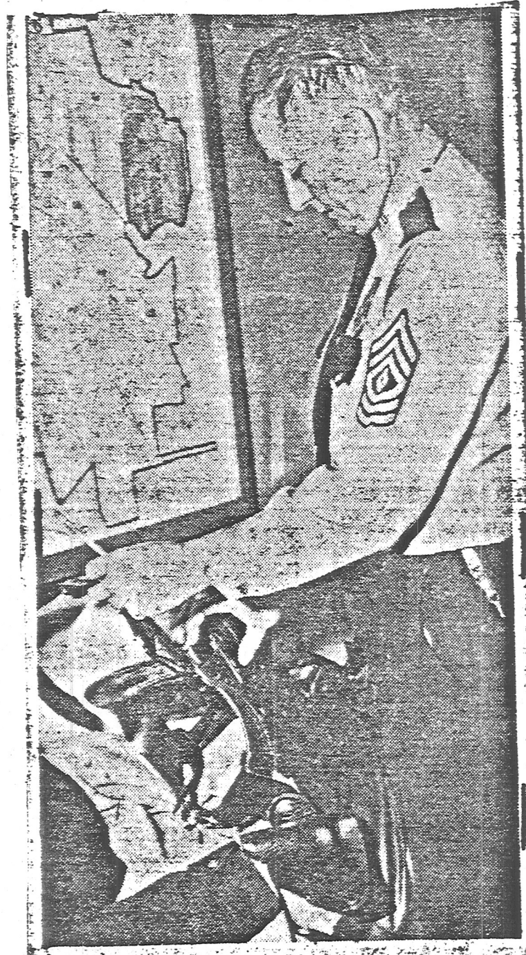
RAD DUTY—Police Set, Charles Bookin glumly checks in a pile of uniforms, belts and service revolvers relinquished by seven Houston policemen involved in a series of theits. These officers were fired and jailed, discharge of a fourth was recommended; and three others rationed.