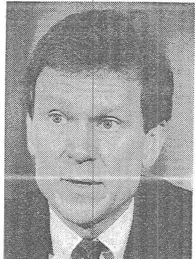
REP. NEWT GINGRICH ... said GOP had to aim high