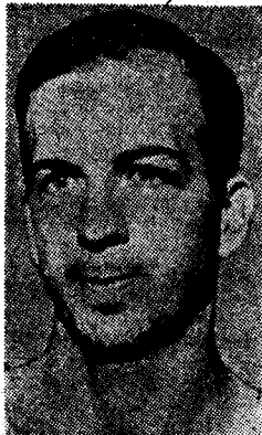
LEE HARVEY OSWALD ... in declassified papers

isfaction that he had no such connection . . .